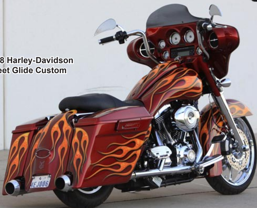
2008 Harley-Davidson Street Glide Custom